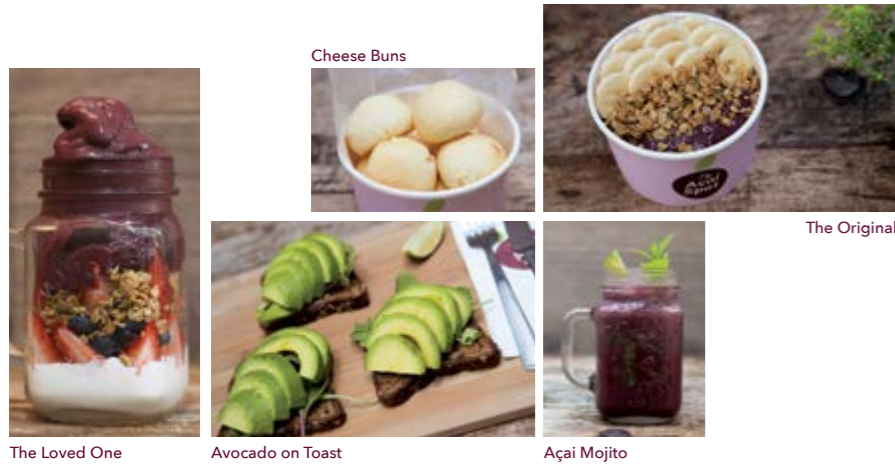
The Loved One